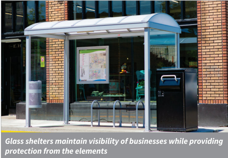
Glass shelters maintain visibility of businesses while providing protection from the elements

This project is being introduced in phases, with anticipated completion in 2024.