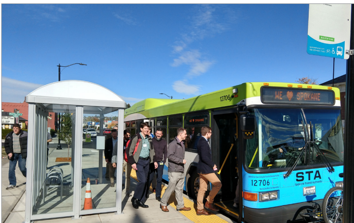
Passengers board along Monroe at a future Monroe-Regal Line station location.

High performance stations will be distinctly branded and provide various passenger amenities.