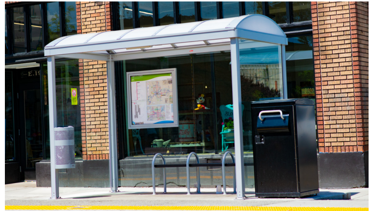
Glass shelters maintain visibility of businesses while providing protection from the elements