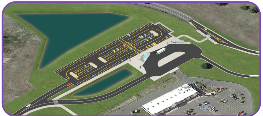
West Plains Transit (illustrative purposes only)

This facility, located at Exit 272 of I-90, will address several transportation issues on the West Plains. Currently transit customers are required to travel to Downtown Spokane to make a connection between any of the cities on the West Plains. This transit center would allow customers to change buses on the West Plains, saving time. The facility would include a park and ride for commuters, utilizing existing service between Spokane and Cheney efficiently.