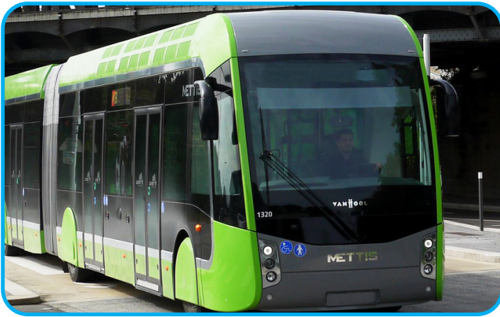
Modern Electric Trolley (MET) (illustrative purposes only)

The creation of the Central City line will move more people without more cars, help grow the Central City economy and optimize financial investments in Central City infrastructure. Running from Browne's Addition through Downtown Spokane and Gonzaga University to Spokane Community College, the Central City line will provide frequent service, expand the hours of service, provide improved passenger amenities and operate with electrically powered buses. This line will allow more transit options throughout the region for people who don't need to travel through downtown to reach their destination.