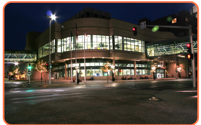
STA Plaza at night

To meet Connect Spokane policy FR3.1, existing Route 28 requires service that lasts until 10pm on Saturdays and 9pm on Sundays. More than 9,700 people within ¼ mile of this route have regular bus service on weekdays but do not have adequate weekend service.