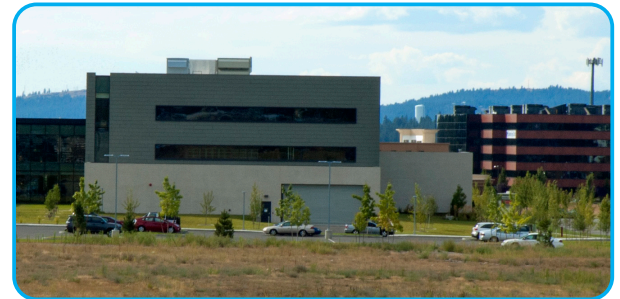
New Development in Spokane Valley

New apartment, office and medical developments along Indiana, east of Sullivan Road would see new service. This area is not currently served with basic fixed route service but Spokane Transit has received numerous requests for many years. Adding this service would allow existing Route 98 to remain south of I-90, serving the area of southwest Liberty Lake.